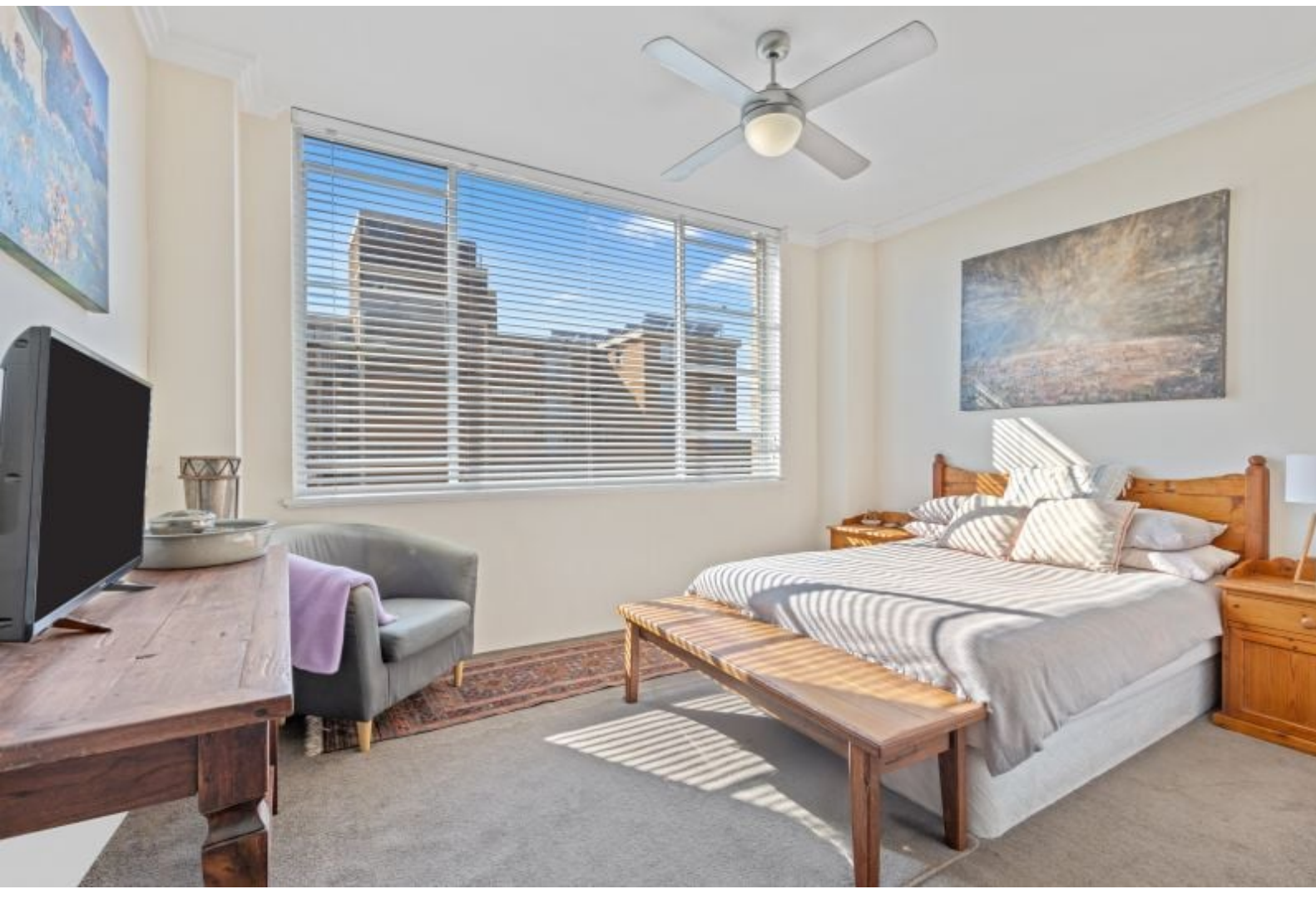
42/49-51 Cook Road, Centennial Park